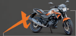
HEAVY GREY WITH ORANGE