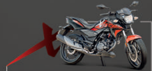
BLACK WITH SPORT RED