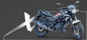
PANTHER BLACK WITH FORCE SILVER