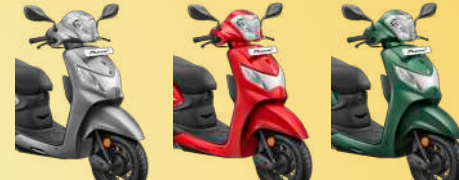
MATTE VERNIER GREY*