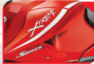
STREET FIGHTER LOOKS & GRAPHICS