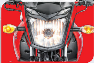
THE WOLF-EYE HEADLAMP