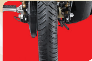
WIDE REAR TUBELESS TYRE