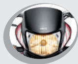
Always Headlamp On