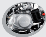
Superior Mileage Engine