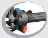
Convenient Power Start